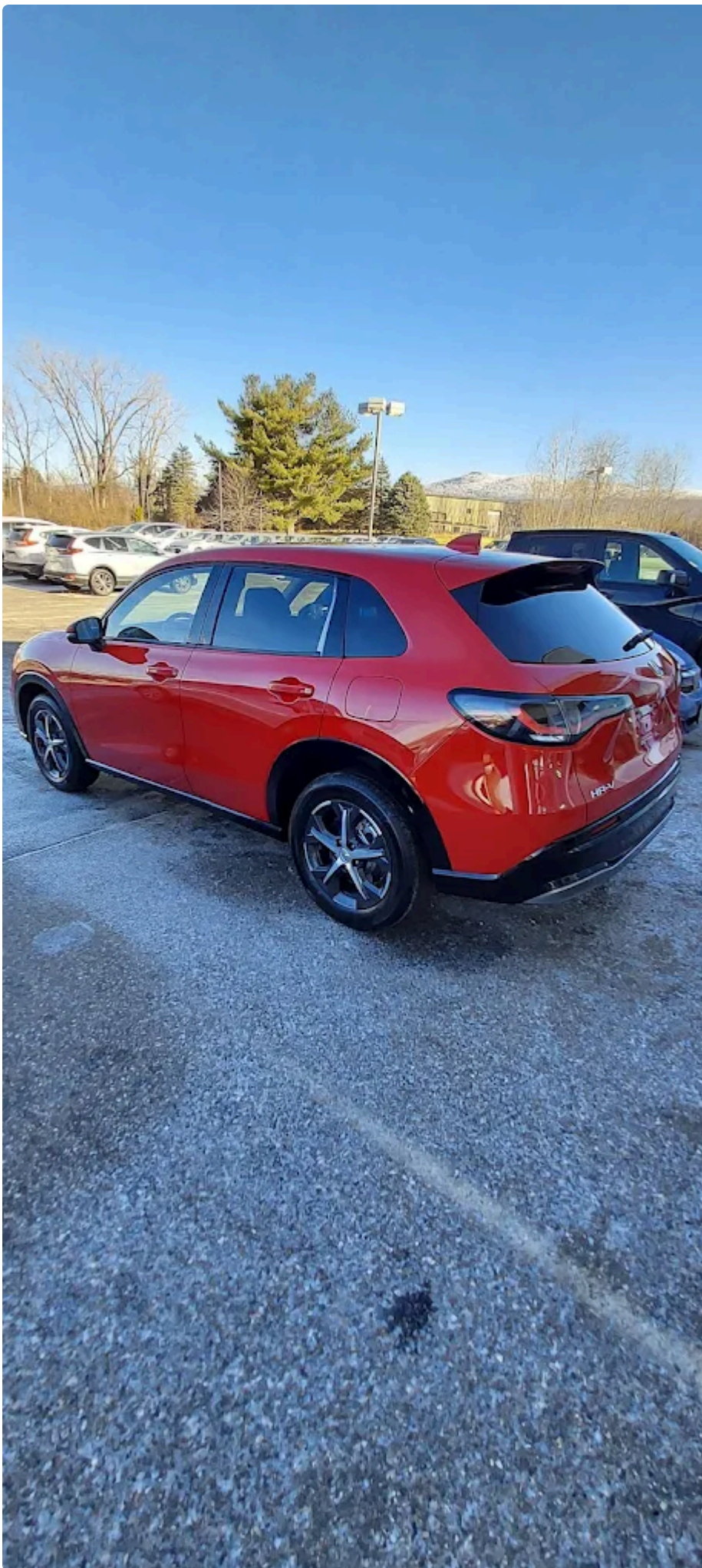
Access to Modern Features at a Lower Price